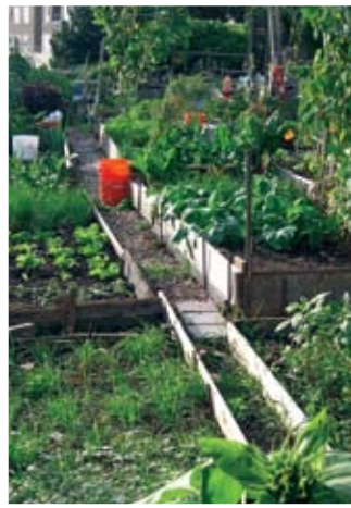
the best crops