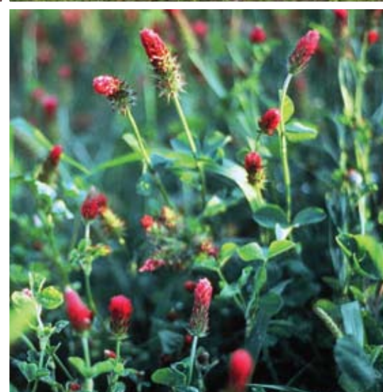
Cover crops (like this crimson clover) or leaf mulch should cover any exposed soil, to prevent winter weeds and erosion.

Fall is also a great time to chop up old garden plants, along with grass clippings and fall leaves, to build your compost pile . Choose a shady spot, and moisten materials as you build your pile. You can also learn how to compost kitchen scraps in a rodent-resistant worm bin or Green Cone. Weeds and diseased plants, along with dairy or meat scraps from the kitchen, should go into the City's yard-and-food-waste collection bins for hot composting at Cedar Grove. Come spring, you can harvest your own compost or buy compost to enrich your soil for another year of growing.