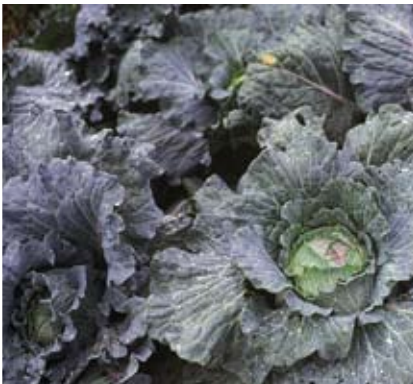
The fall garden can be full of food that you planted in summer, to harvest into the winter.