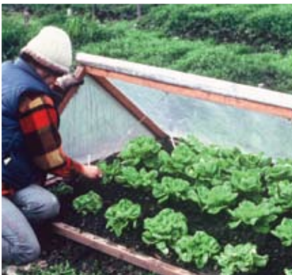
Get a jump on spring by starting plants under cover. Extend summer crops into fall under cover too.