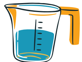
Liquid measuring cup

Fill liquid measuring cup with liquid to the right quantity marker line. To check, place the cup on a flat surface and check measured quantity at eye level.